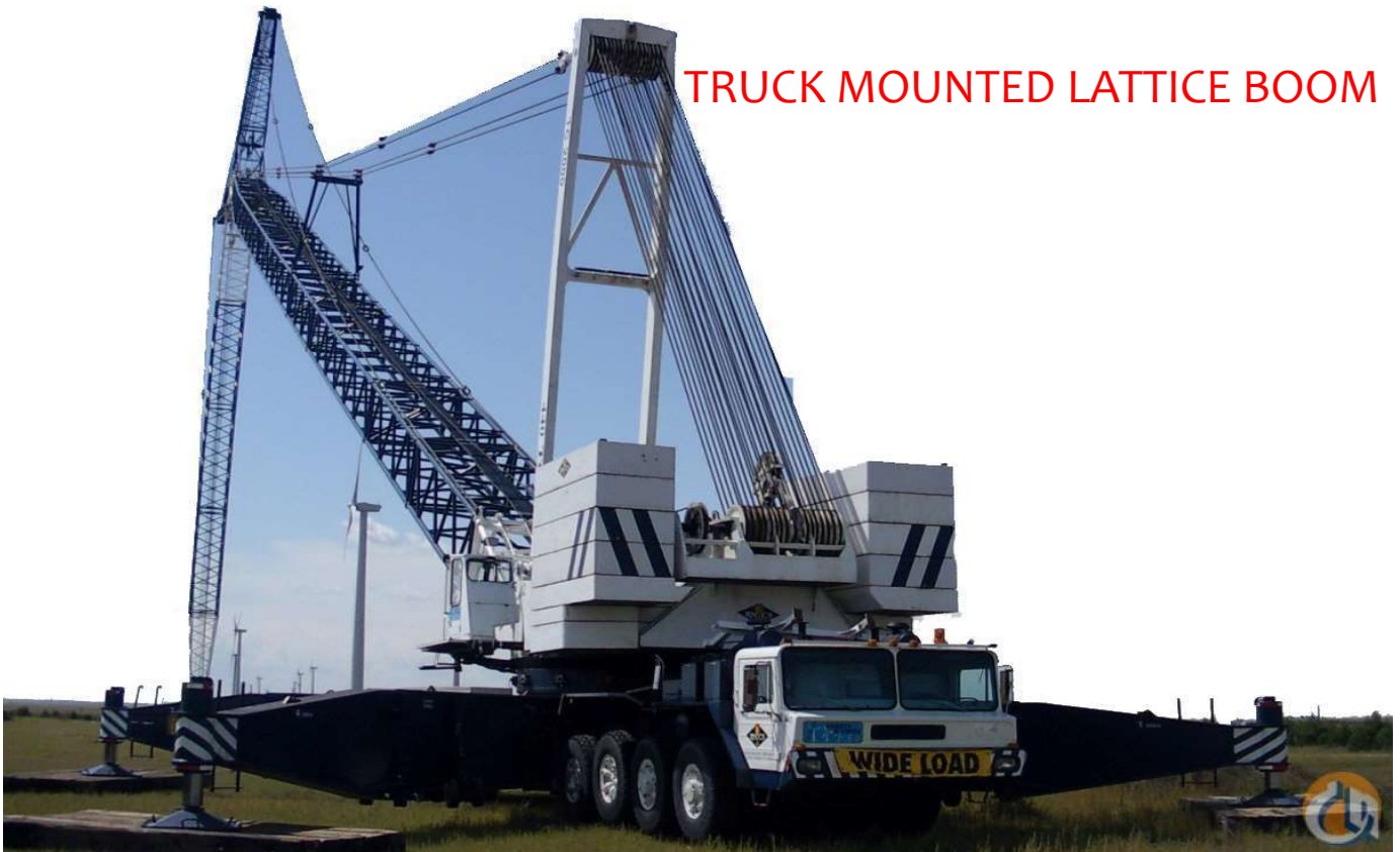
TRUCK MOUNTED LATTICE BOOM