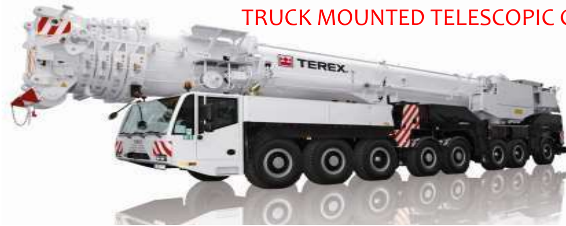
TRUCK MOUNTED TELESCOPIC CRANE